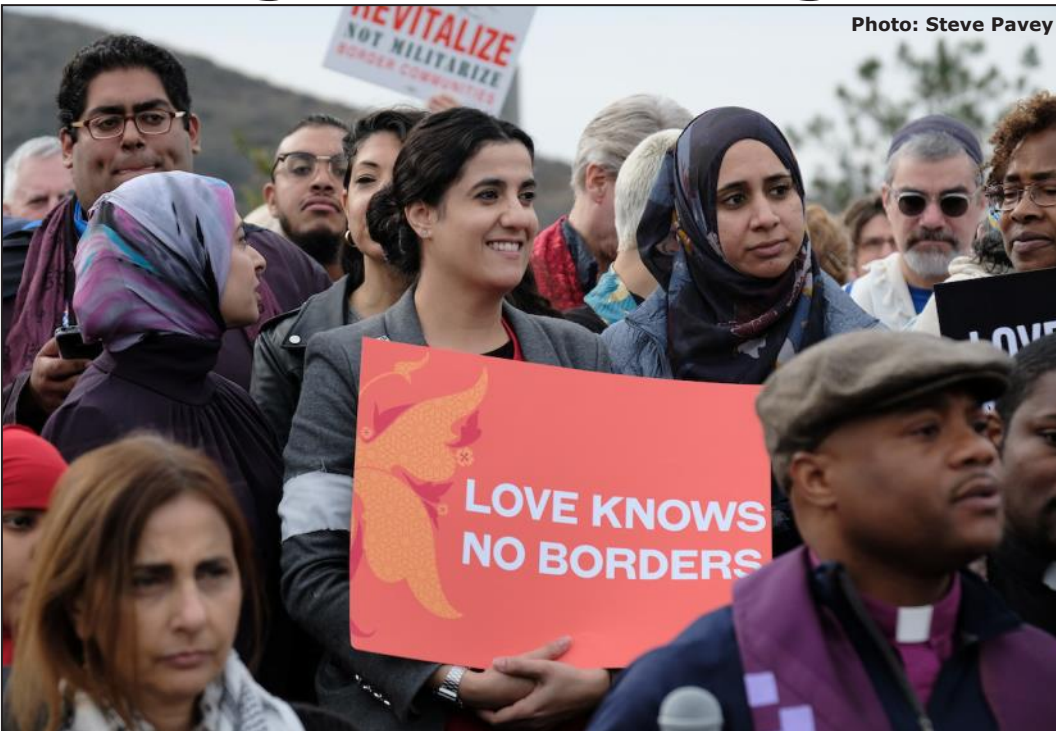
Hundreds of faith leaders from diverse traditions, including the author, gathered at the San Diego / Tijuana border to denounce the U.S. government response to asylum-seekers on the U.S. southern border on December 10. Dozens were arrested.