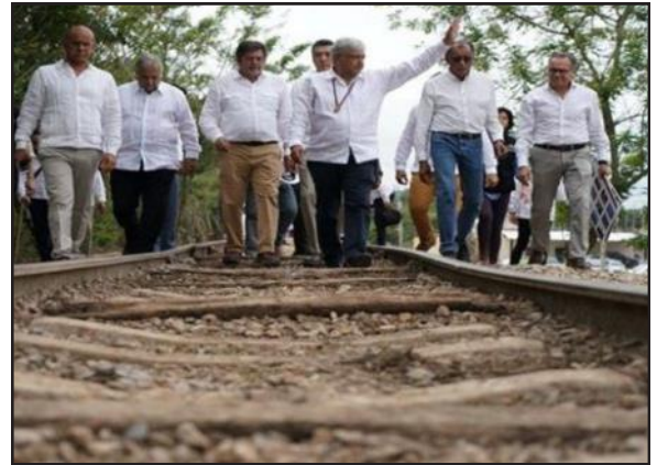
Incoming Mexican president, Andres Manuel Lopez Obrador, promotes the "Mayan Train" project with Mexican officials.

Lopez Obrador claims that his administration will divest from the old ways of the establishment. His plans for Mexico's southern region however, are incongruent with his rhetoric of change. Included in Peña Nieto's plans were the development of railroads, and taking advantage of the region's biodiversity for the extraction of natural resources and the