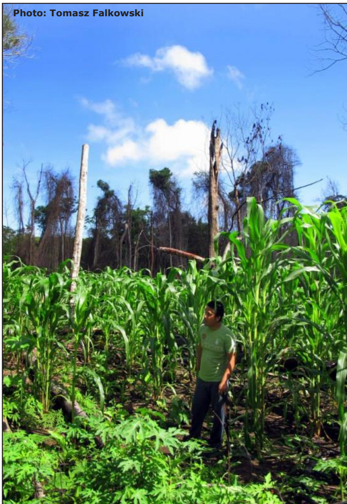
Many traditional smallholder farmers throughout Mesoamerica have noticed that climate change is affecting the productivity of their agroecosystems.

Mesoamerican migrants. The nexus between climate change and the global expansion in migration underscores the need for integrative policies that meaningfully address both issues, such as collaborating internationally to restructure water management policy in a way that ensures equal access to water and reduces pressures on water resources.